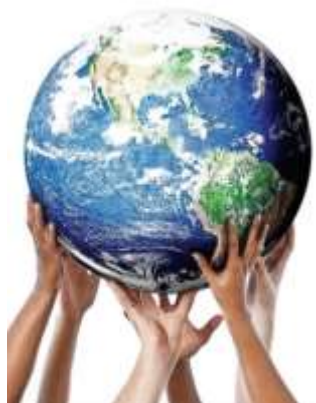
Being Me in My World Maslow's Triangle - PowerPoint Slide 1 - Ages 10-11 - Piece 3