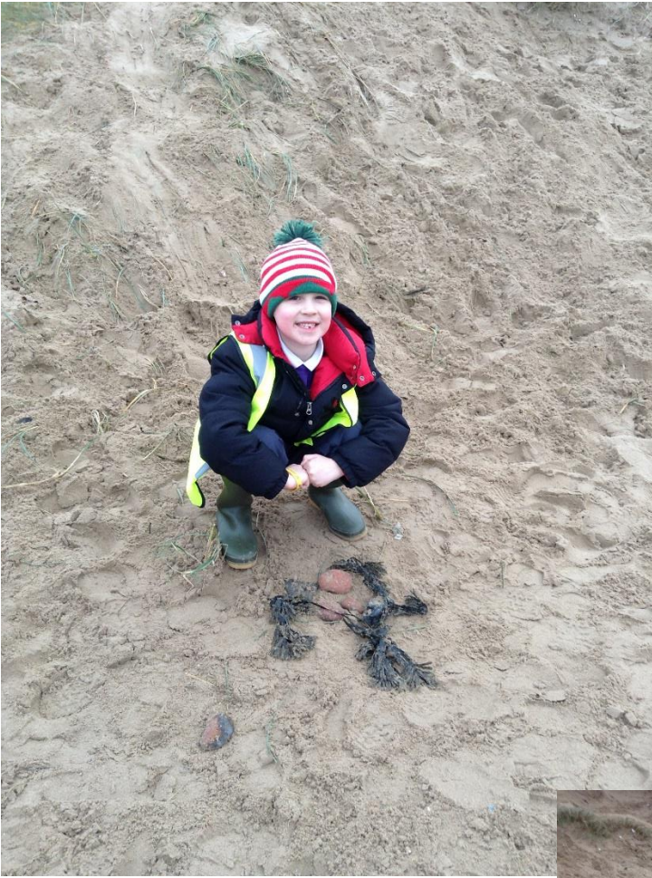
Artwork on the beach