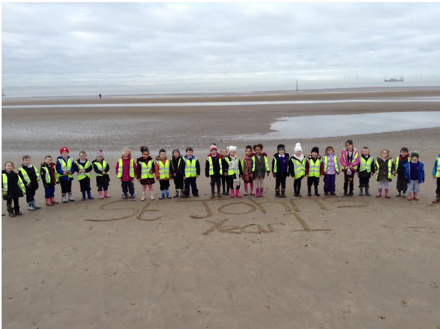
Children enjoying our coastal schools sessions on Crosby beach.