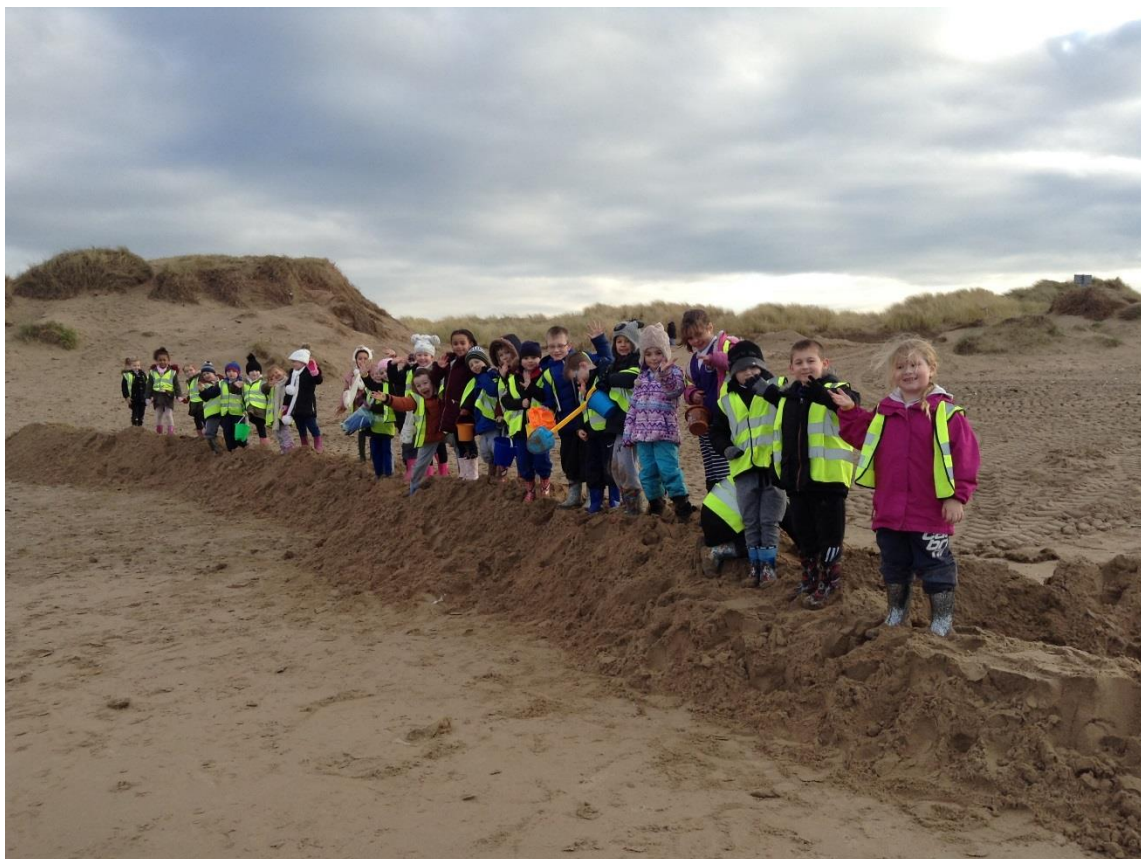
Exploring the sand gathered by the tractor